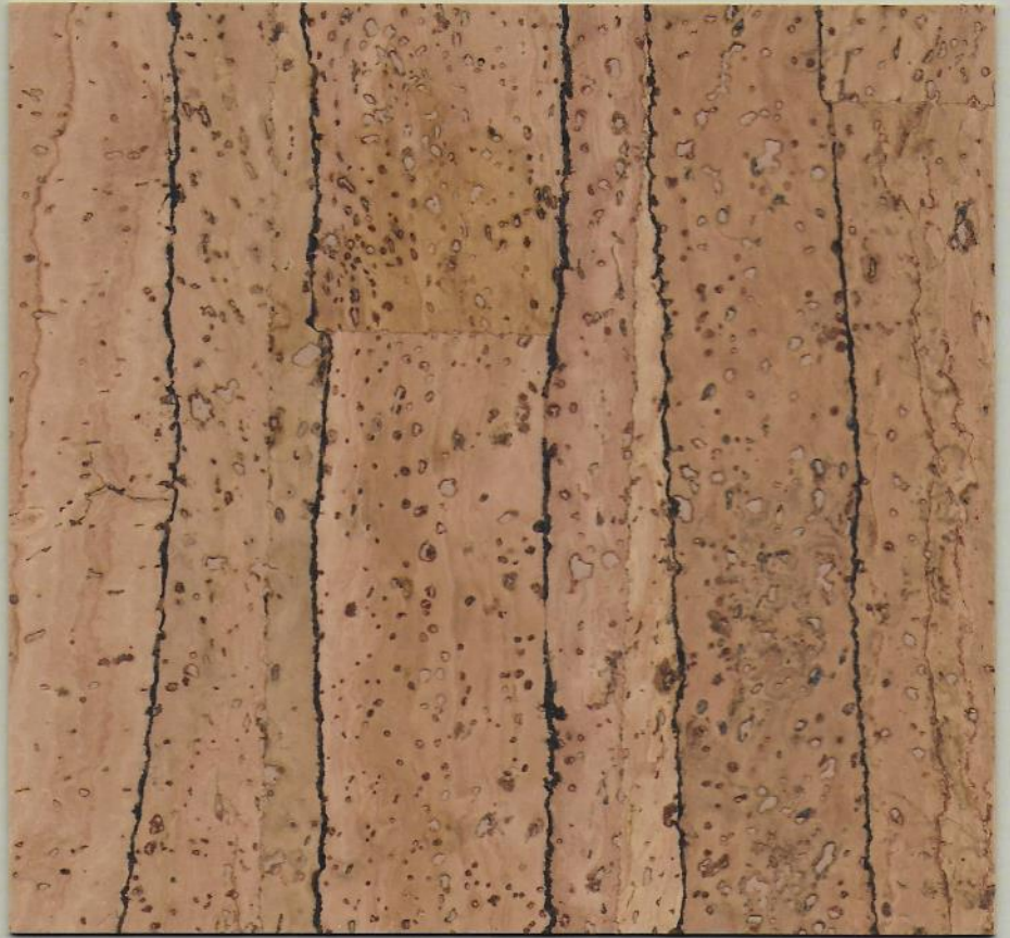
3013 AMERICAN ALOE