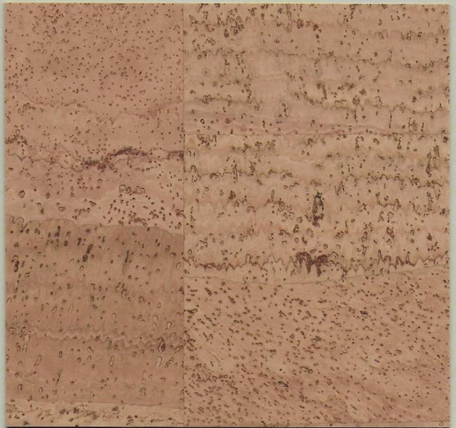
3002 MIMOSA BUSH